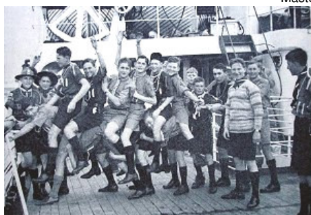
1929 Participants on route to England aboard the mail ship and at the Jamboree at Arrowe Park. See the Springbok head above the Springbok skin camp notice board.